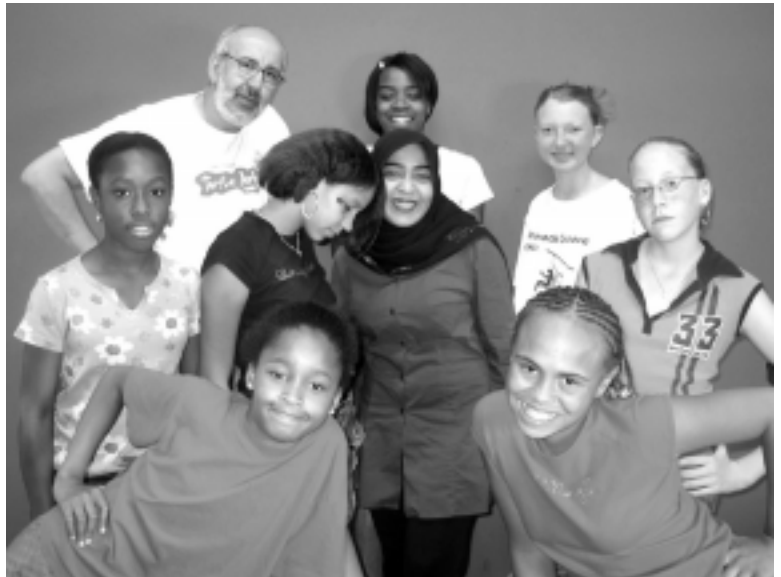
Girls from the Media Smart Youth program at MTN

This year our work was supported by the City of Minneapolis, Time Warner Cable, the University of Minnesota's Humphrey Forum, and the Listen Up Youth Project. Additional participants included Minneapolis South High students, The City Inc North and South Campus, Phillips Community TV, Americorps Youthworks, Emerson School, Fairview Park, the HAAS Program, Webster School, Glenwood Lyndale Community Center, Plymouth Youth Christian (PYC), and Minnesota Transition High School.