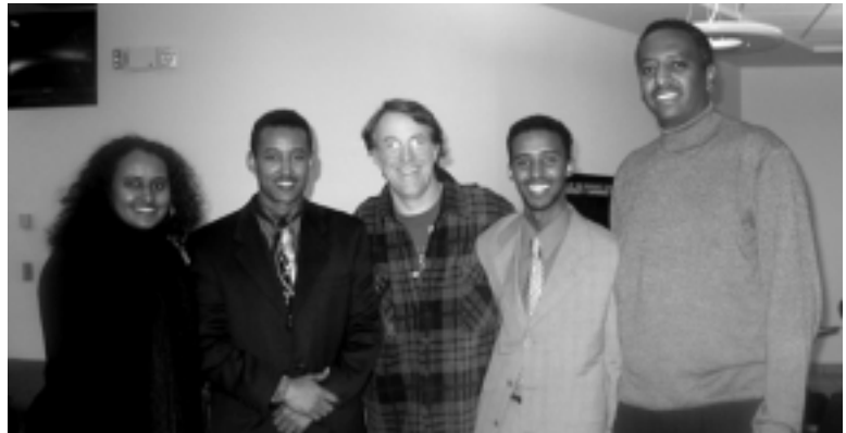
MTN producers spoke on a panel at the Alliance for Community Media conference in February 2003.