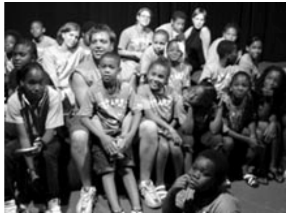
Children from the Star Program watch themselves on TV.

MTN's strength is our Membership. Our goal is to keep it fresh, diverse and evolving. Last year, MTN conducted 26 free introductory workshops in which citizens were educated about community television. Many of those attendees went on to sign up for classes and produce programs. Beyond our Introductory Workshops, we hosted a number of visitors, including local youth groups, non-profit organizations and foreign media guests of the International Center.